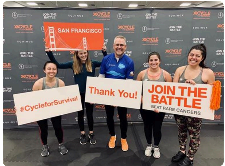
Salesforce Ohana during Cycle for Survival